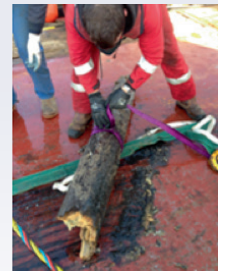
Example of a false alarm: possible torpedo turns out to be a log