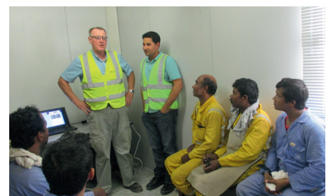
NINA training in Qatar

and fathers who want to go home at the end of the day still in one piece. We can't change old habits with one workshop. But I do see people's attitudes becoming more open and interactive. We are definitely taking a step forward!"