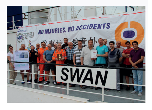
| NINA Start Up meeting on board Swan

main dilemma. Most people avoid conflicts. That is why it is important to see feedback in a different perspective: not as criticism, but as an expression of concern. It is all about care for your colleague's, care for third parties. We are struggling to bring this into the culture we're striving for."