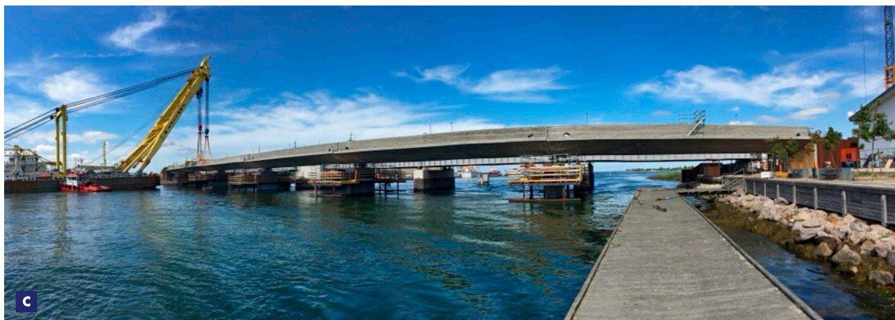
C Installation of last girder D Lifting of the first pillar